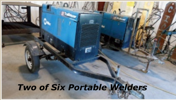
Two of Six Portable Welders