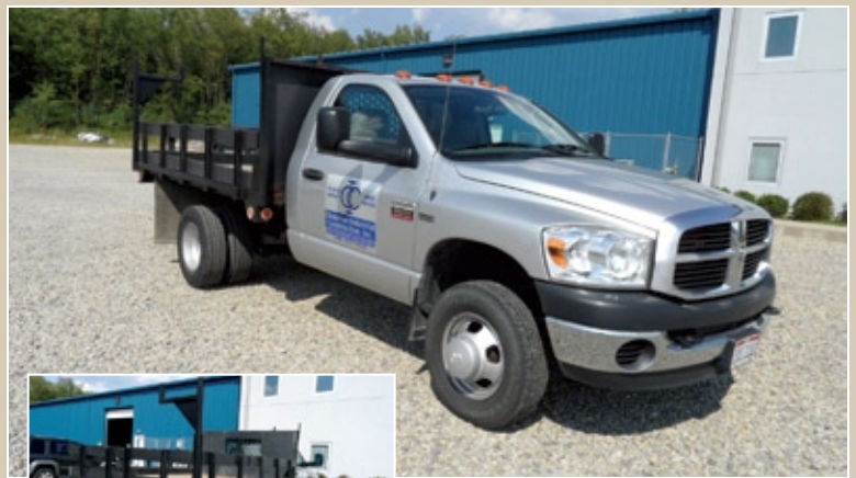
2007 Dodge Ram 3500HD

1995 Ford / Wayne school bus, VIN: 1FDNB80C6SVA19677