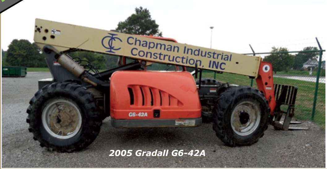
2005 Gradall G6-42A

By Order of Secured Party, Equipment & Vehicles of: Chapman Industrial Construction, Inc. 17 Crown Road, Dover OH 44622