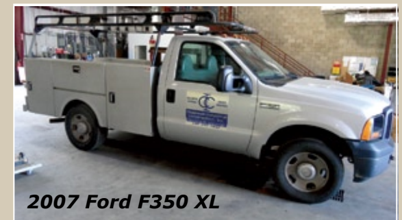
2007 Ford F350 XL