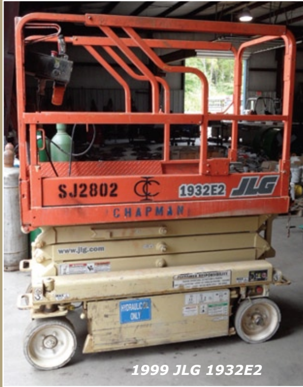
1999 JLG 1932E2