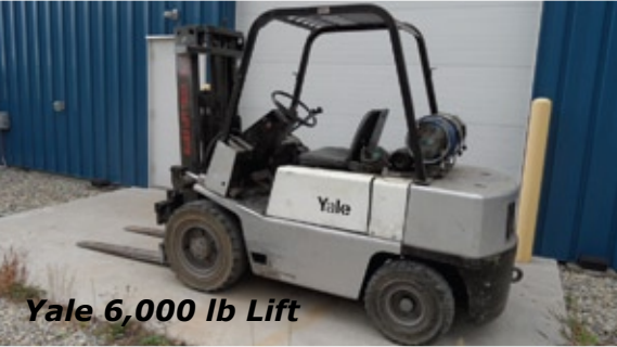
Yale 6,000 lb Lift