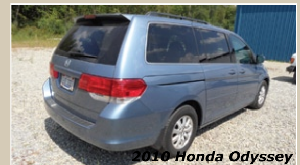
2010 Honda Odyssey