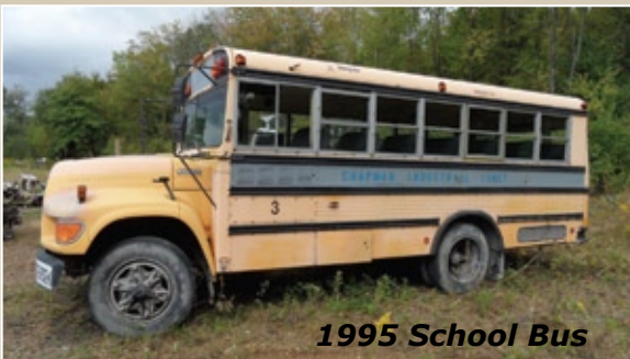
1995 School Bus

PAYMENT TERMS: Payment in full upon conclusion of auction by cash or in-state business check. Buyers outside Ohio paying by business check must provide a current bank letter guaranteeing payment to Bambeck Auctioneers Inc.