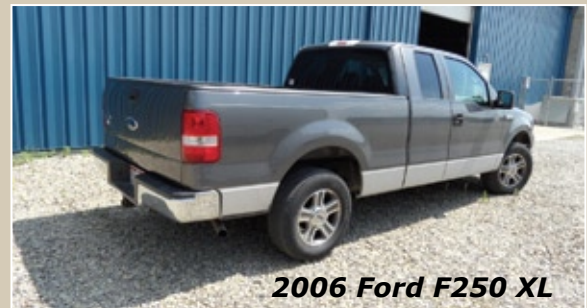
2006 Ford F250 XL