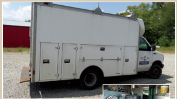
2004 Ford Welding Truck

Cub Cadet LT1046 lawn tractor, hyd. drive, 76 hrs.. on meter