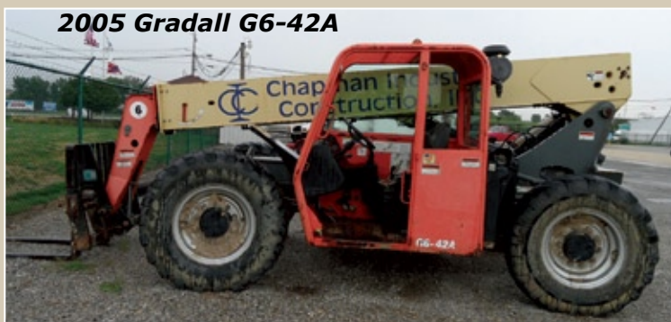
2005 Gradall G6-42A

AUCTION Thurs., October 18 Starting @ 10:00 AM Auction Site: 5617 Crown Road Dover OH 44622