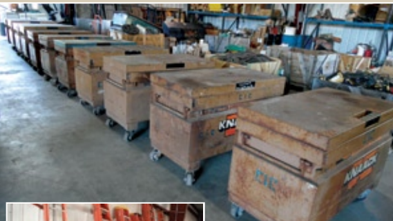
Partial View of (18) Job Boxes (28) Ladders