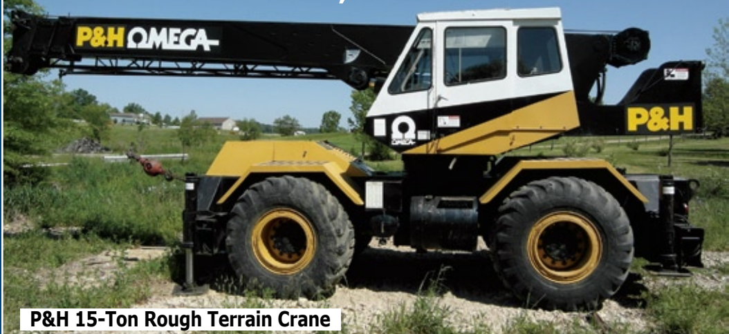
P&H 15-Ton Rough Terrain Crane