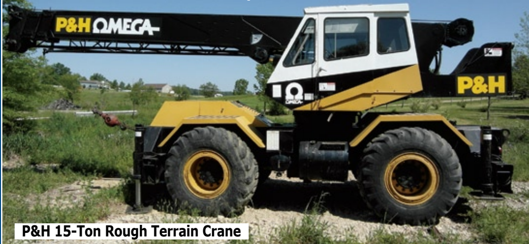
P&H 15-Ton Rough Terrain Crane

Nu-Way Construction, Inc. 9816 Ashland Road (US Route 250) Wooster, OH 44691