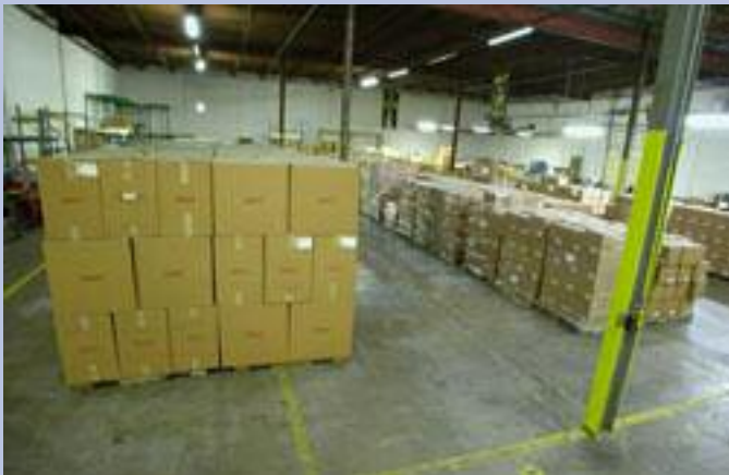
Partial View Packaged Products