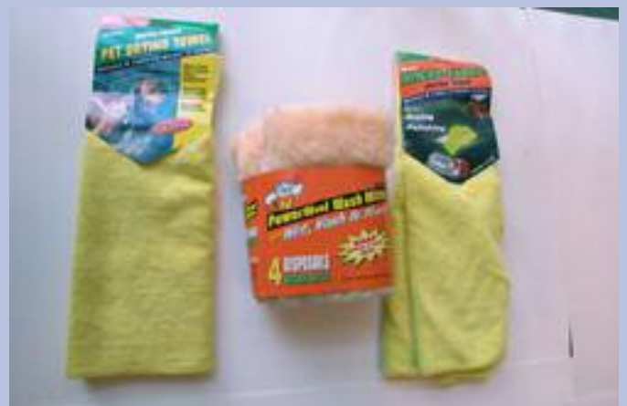
Radom View of Packaged Products