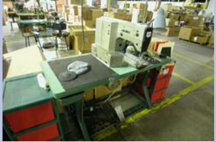
Juki Sewing Machine