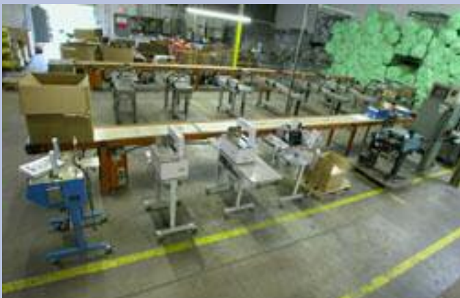
Partial View Packaging Equipment