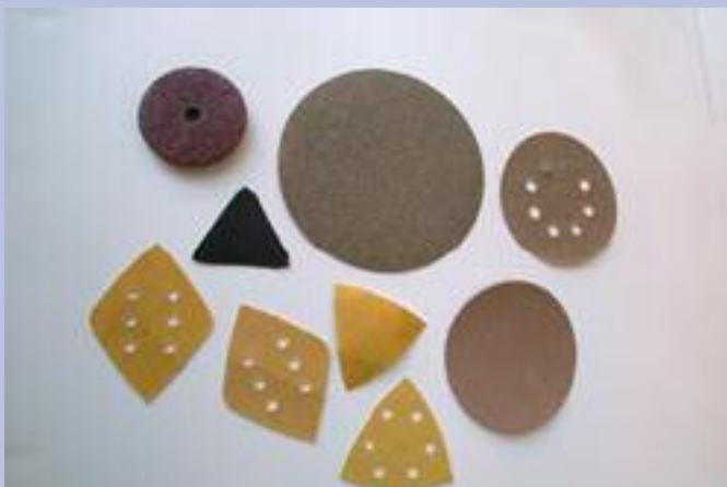
Sampling of 300,000 pcs. cut Sandpaper