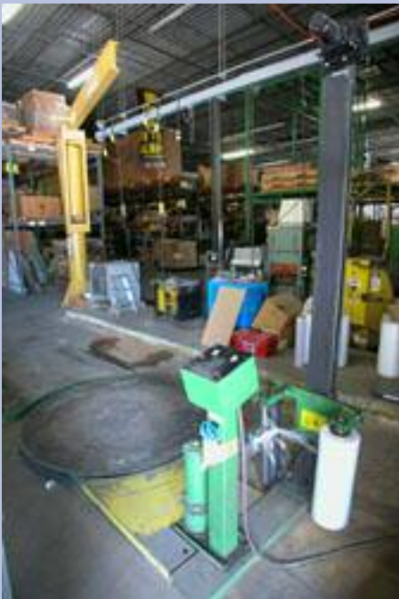
Pallet Stretch Wrapper