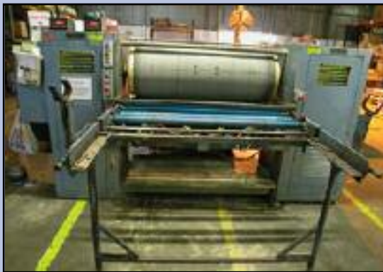
Corfine Web-Fed Rotary Die Cutter

NIC•SAND ENTERPRISES, LLC 250 Sheldon Rd. Berea (CLEVELAND) OH 44017