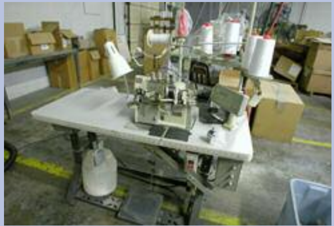
Pegasus EX 5104-52D