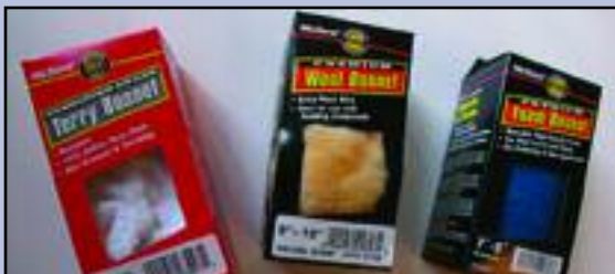
Partial View of Packaged Products

Executive Office Furnishings Business Machines