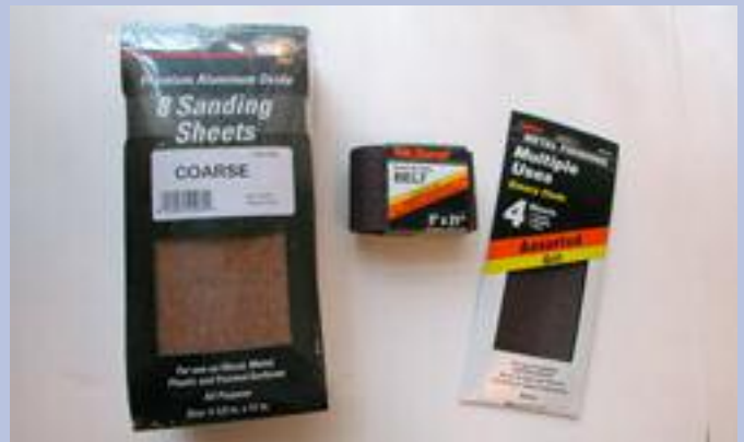
Radom View of Packaged Products