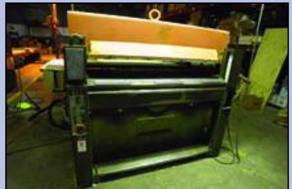
Atom S359 Hydraulic Beam Press