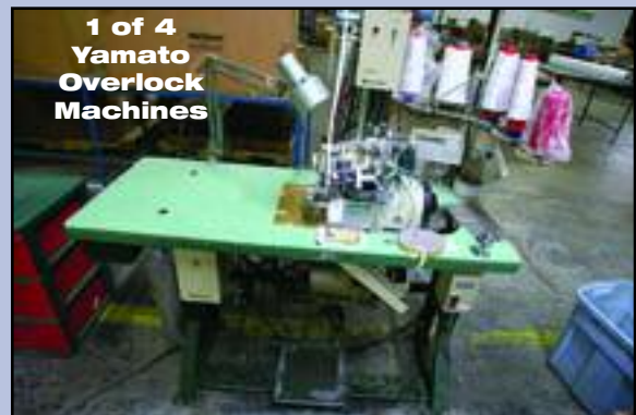
1 of 4 Yamato Overlock Machines