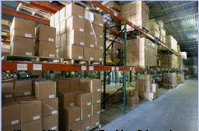
View of Warehouse Racking & Inventory