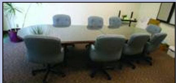
Executive Office Furnishings

AUCTION DATE: THURS., JUNE 23 BEGINNING AT 9:00 A.M. (2005 Auction)