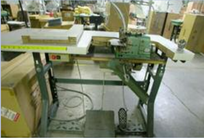
1 of 8 Merrow Sewing Machines