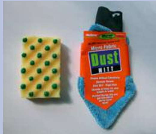
1 of 75,000 bulk Glass Scrubbers (left) Packaged Dust Mitt (right)