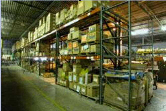
View of Warehouse Racking & Inventory