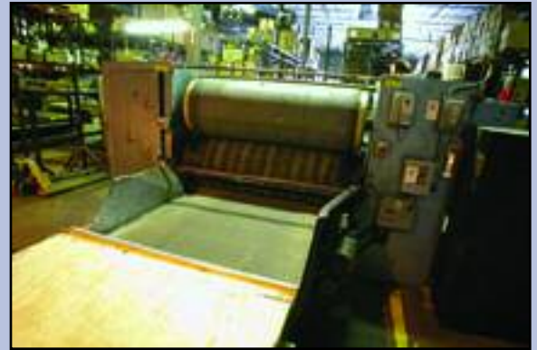
Corfine Web-Fed Rotary Die Cutter

Mitsubishi LU2-4410, s/n B1T-521542, foot lifter