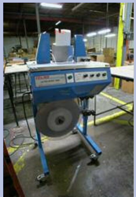
Felins Package Tape Bander

NOTE: Although the information contained herein has been obtained from sources believed to be reliable, prospective buyers are encouraged to make their own inspection prior to purchase. Neither the auctioneer nor the seller assume responsibility for errors or omissions in advertising material. All items sell as is, where is. THE ITEMS LISTED HEREIN MAY BE INSPECTED ON JUNE 22, 9:00 AM TO 5:00 PM and morning of auction beginning at 8:00 A.M.