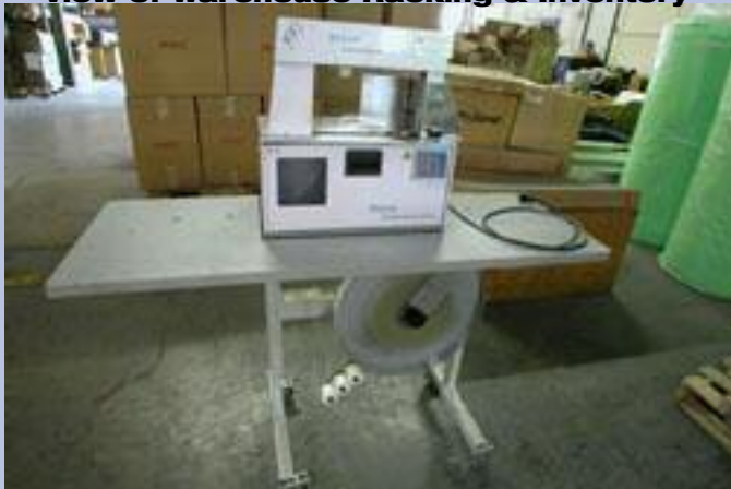
1 of 2 Wexler Banding Machines