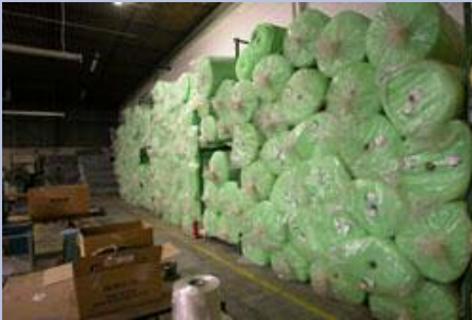
View of 10,000 yds. Synthetic Wool