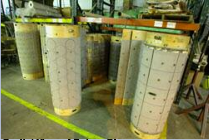
Partial View of Rotary Dies