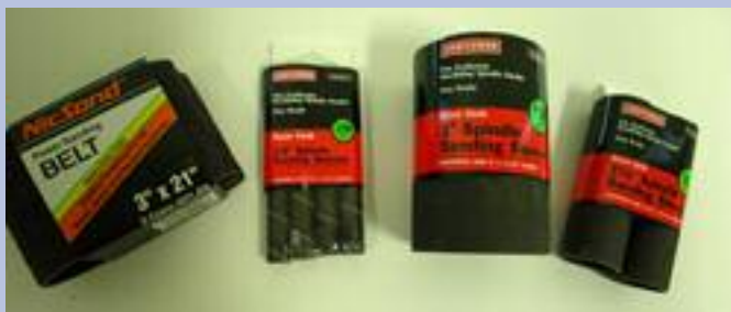
Radom View of Packaged Products