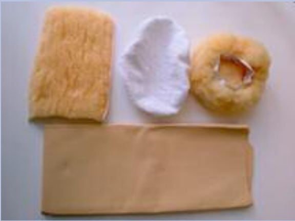
Polishing Bonnets, Mitt, Synthetic Chamois