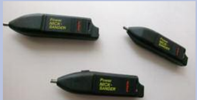
3 of 45,000 Nic Sander Power Units