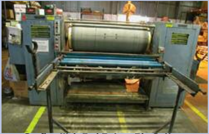
Corfine Web-Fed Rotary Die Cutter