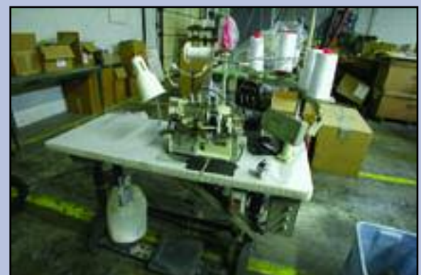
Pegasus EX5104-52D overedger