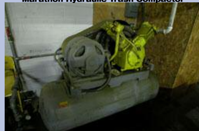
10 hp Air Compressor