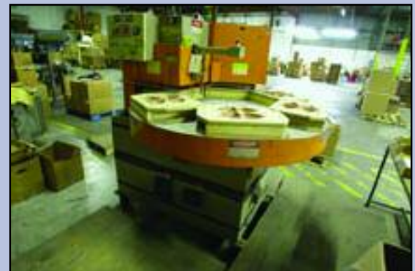
ZED 15-RS Rotary Packager