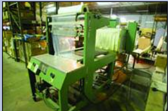
Great Lakes Shrink Packager

(2) Craftsman tool chests • assorted hand tools • assorted power hand tools • (3) light duty floor standing drill presses • Craftsman 10" bench table saw • benchtop combination 1" belt/4" disc sander • 9" disc sander • Ryobi spindle sander • 5"x20" belt sander • Craftsman vert. band saw • bench grinder • numerous shop vacs • misc. tools • table top 150 lb digital scale • ladder • work tables & benches • pedestal ventilation fans • folding tables • stack chairs • shelving • packaging supplies • wood pallets • lots of misc.