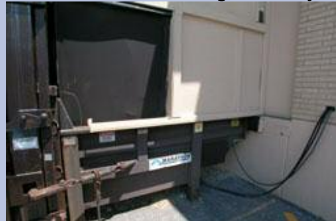
Marathon Hydraulic Trash Compactor