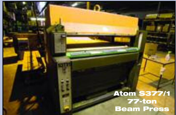
Atom S377/1 77-ton Beam Press