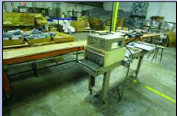
View of Conveyor & Clamco Packager