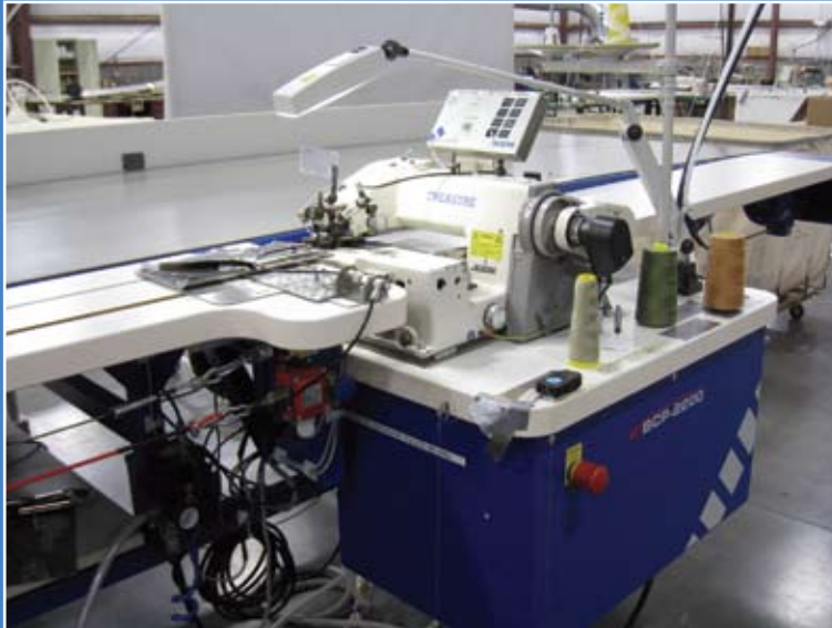
Brother ACP 2000 & BCP 2200 Automatics

Court-Ordered Auction of Commercial Drapery Mfg. Equipment