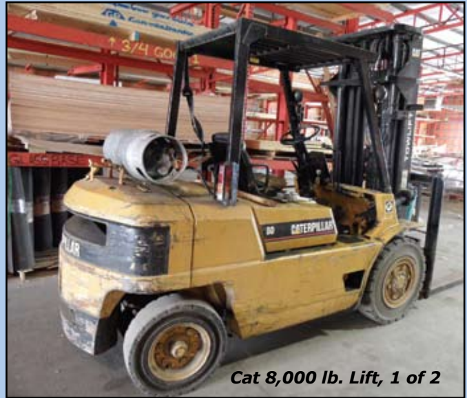
Cat 8,000 lb. Lift, 1 of 2