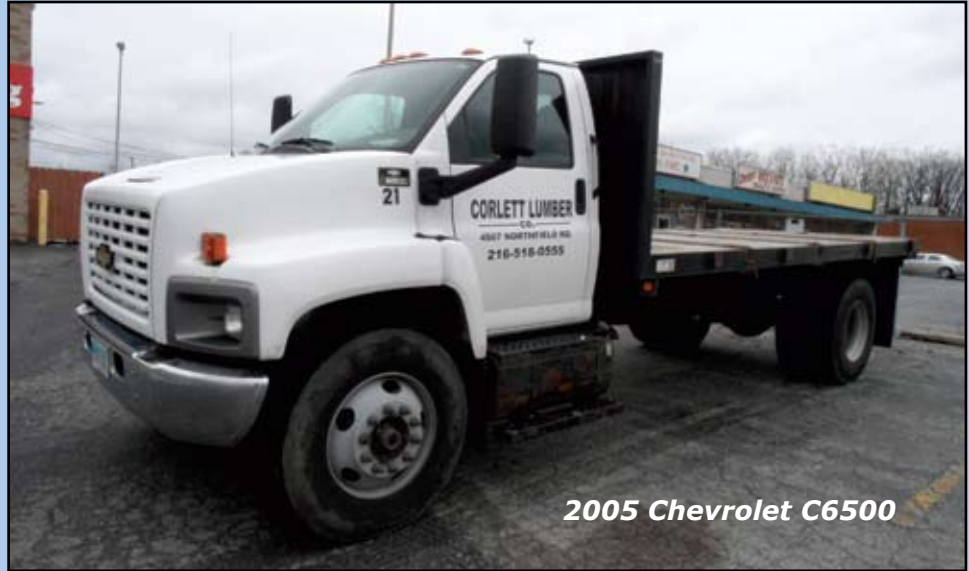
2005 Chevrolet C6500

Corlett Lumber Company 4567 Northfield Road Warrensville Heights OH 44128