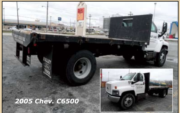
2005 Chev. C6500