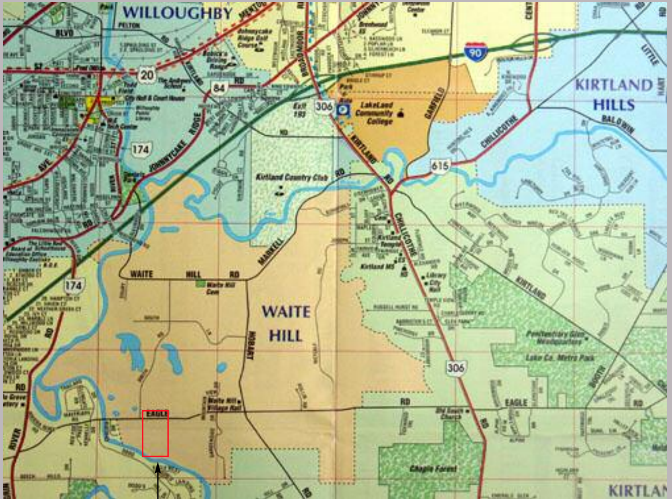
Detail Shown On Previous Page