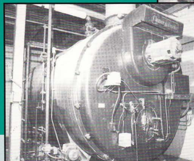
▼Cleaver Brooks 400 HP Gas Boiler

BAMBECK AUCTIONEERS INCORPORATED auctioneers - real estate brokers