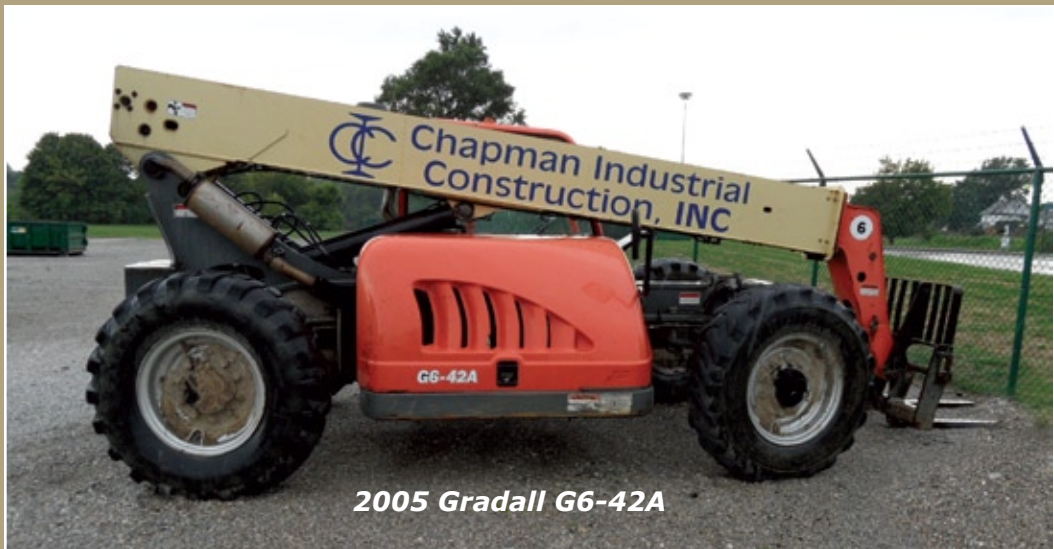
2005 Gradall G6-42A

By Order of Secured Party, Equipment & Vehicles of: Chapman Industrial Construction, Inc. 5617 Crown Road, Dover OH 44622