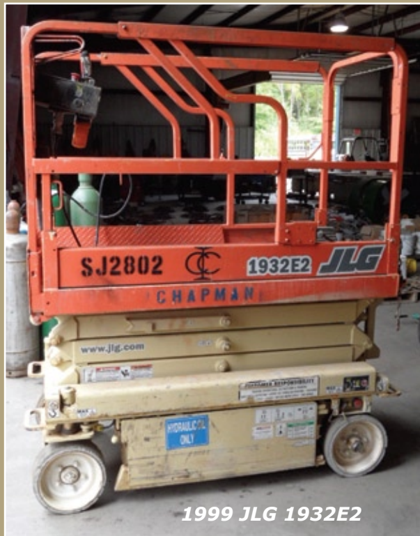
1999 JLG 1932E2